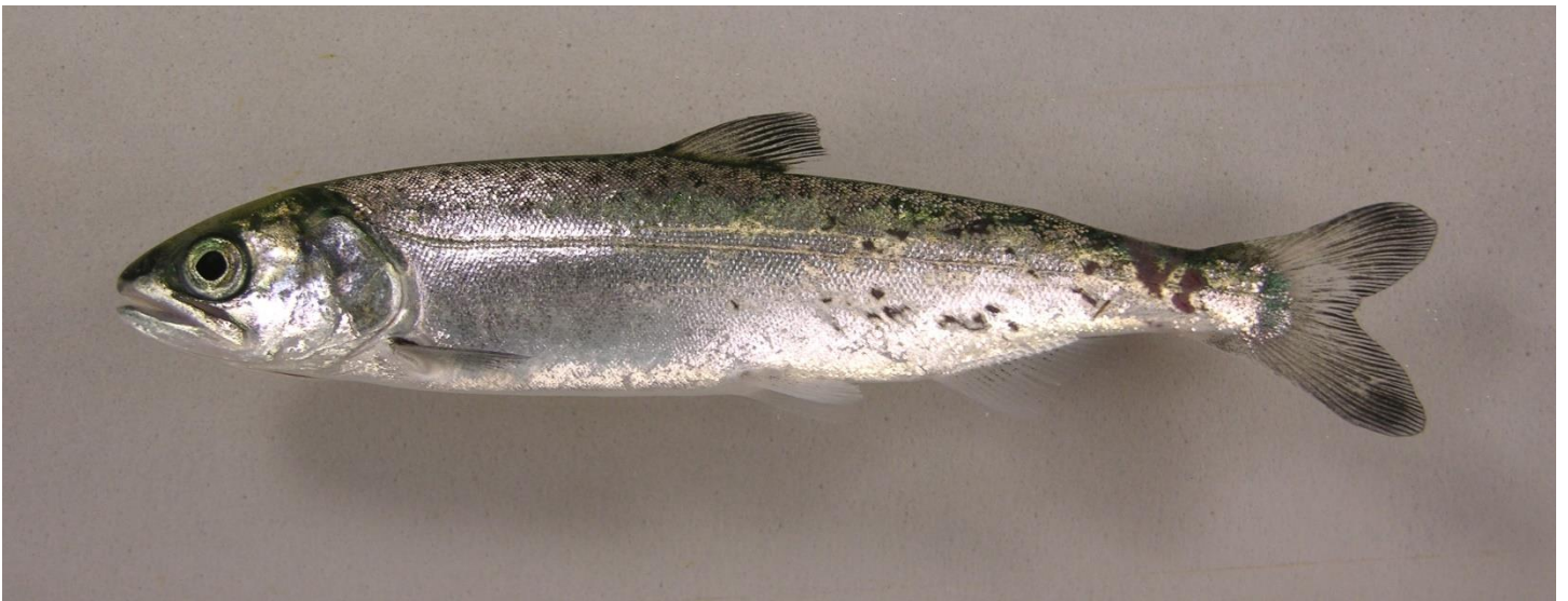
Subyearling Fall Chinook smolt ( Oncorhynchus tshawytscha ), approximately 120 mm fork length, showing scars from a fish predation attempt, similar to a specimen sampled at the John Day Dam Smolt Facility on 12 August, 2024.