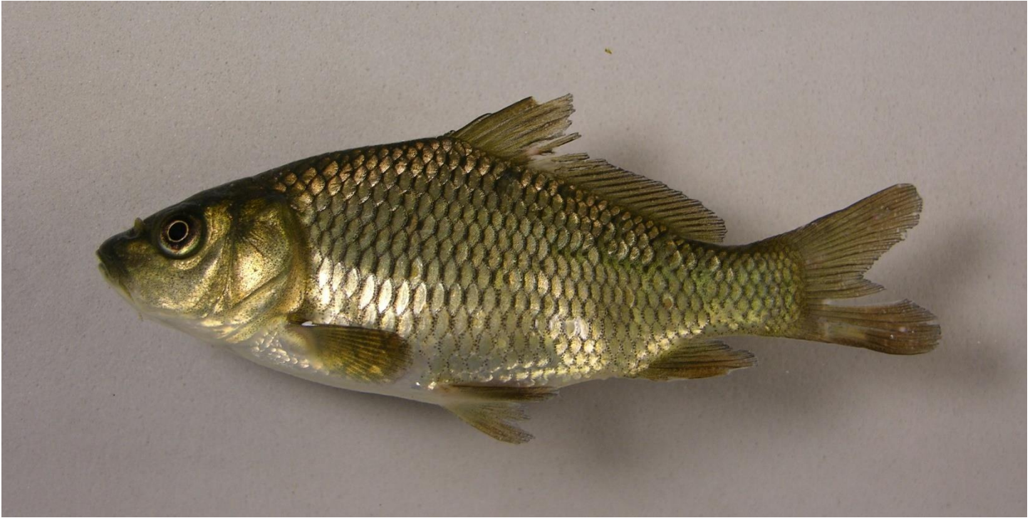
Juvenile Common Carp ( Cyprinus carpio ), approximately 90 mm total length, sampled at the John Day Dam Smolt Facility on 19 August, 2024.